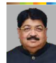
Mr. Parimal Nathwani Group President of Corporate Affairs & Projects Reliance Industries Limited