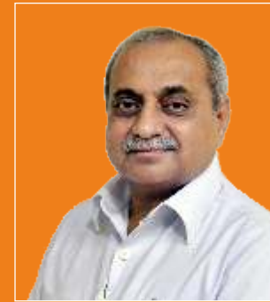
SHRI NITIN PATEL, HON'BLE DEPUTY CHIEF MINISTER, GOVERNMENT OF GUJARAT

We want to make Gujarat once again a Manchester of the East and become number one in textiles. Gujarat already has large spinning capacity; adding weaving and garmenting would make it possible to achieve the complete textiles and apparel value chain. Our aim is to provide employment to women and create investment opportunities in the complete value chain from cotton to fabric to clothing.