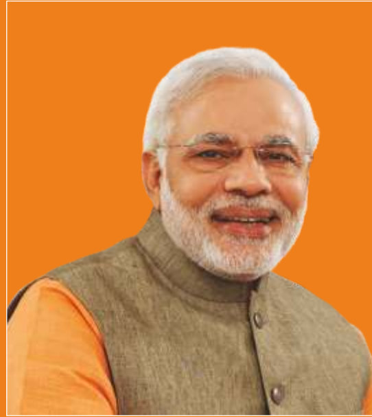
SHRI NARENDRA MODI, HON'BLE PRIME MINISTER OF INDIA.

The textiles industry has a pivotal position in the Indian economy. It is strong and competitive across the value chain. India has an abundant supply of raw material like wool, cotton, silk, jute and man-made fibre. India has strong spinning, weaving, knitting and apparel manufacturing capacities. The textile industry will have to constantly innovate and research for growth and to tap new markets. Based on Make In India, the textile industry is being infused with the mantras of 'skill, scale, speed' and 'zero-defect, zero-effect'.