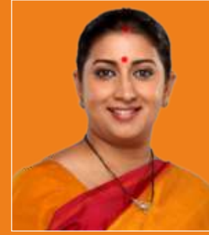
SMT. SMRITI IRANI, HON'BLE MINISTER OF TEXTILES, GOVT. OF INDIA

The textiles industry has a pivotal position in the Indian economy. It is strong and competitive across the value chain. India has an abundant supply of raw material like wool, cotton, silk, jute and man-made fibre. India has strong spinning, weaving, knitting and apparel manufacturing capacities. The textile industry will have to constantly innovate and research for growth and to tap new markets. Based on Make In India, the textile industry is being infused with the mantras of 'skill, scale, speed' and 'zero-defect, zero-effect'.