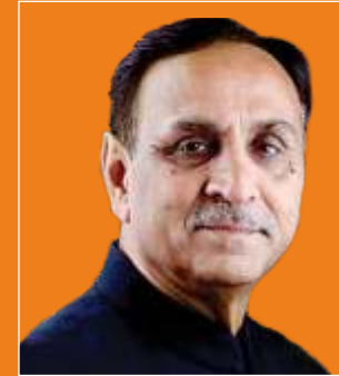
SHRI VIJAY RUPANI, HON'BLE CHIEF MINISTER, GOVERNMENT OF GUJARAT

The spectrum of Indian textiles is extremely diverse and its history is world-renowned. Textile is not just an industry, but also a tradition and a legacy which we present to the world through the magic of India's handcrafts and machines. In the growth of the textiles sector lies the growth of India and the growth of job opportunities.